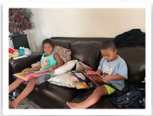
Happy readers with their Barnes & Noble books!